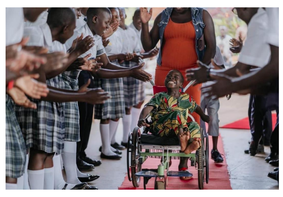
(Photo from 'night to shine' – Students from a local secondary school cheering our students down the red carpet!)

The following week was one of mixed emotions for Ekisa. A little girl from the home passed away unexpectedly which had a huge impact on the staff here. The next day we were running an event called 'Night to Shine', an event to celebrate the lives of all the children in our programmes with special needs and disabilities. This wonderful prom night was created by American footballer and Christian, Tim Tebow and is celebrated around the world. A night centred in God's love, it was an incredibly moving night, where children to dress their best and enter on the red carpet with their families, cheered and celebrated as daughters and sons of the King. A glimpse of the way things should be for these children!