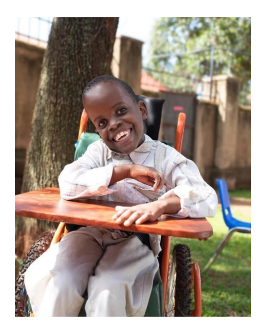
(a happy school photo from one boy at school)

The following week, I got to run my first week of holiday school which involves planning themed activities for the children who are living in the Ekisa home. It was great to get to know the kids better who live in the home and have some fun during our jungle themed week!